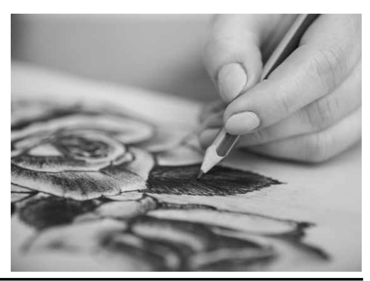
Amherst Center For Senior Services