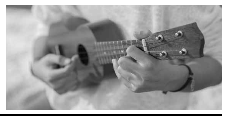
Amherst Center For Senior Services